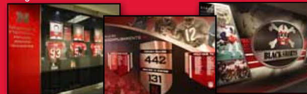
Major Award Winners Display